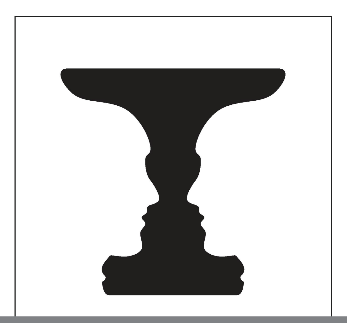
figure/ground - reversible