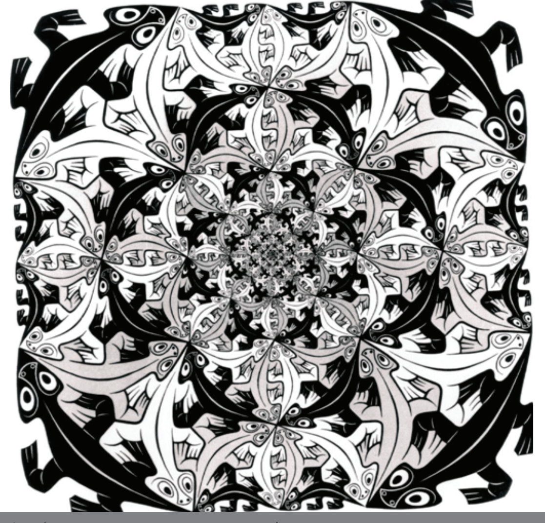
balance – symmetrical